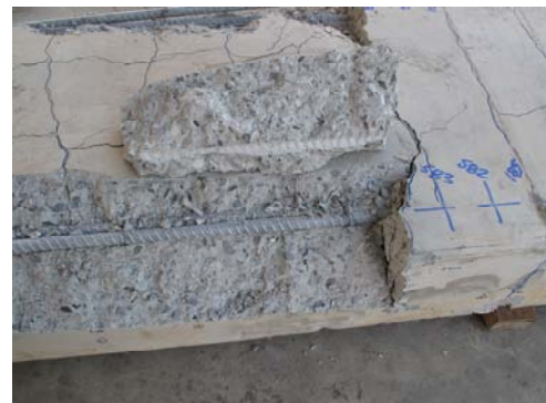
4-bar: face splitting and edge side splitting