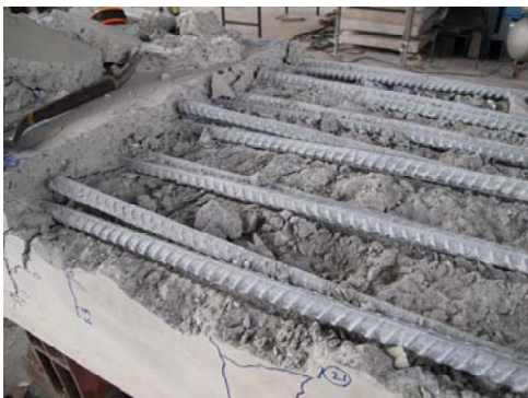
6-bar: side splitting with bar prying

Also, the 4.5 metre long specimens were tested up-side-down to observe concrete crack development on the exposed top face in tension. Both specimens are shown after testing in Fig. 2, where the failure modes are evident: with 6 bars side splitting occurred with a horizontal crack finally forming between all the bars; while with 4 bars splitting failure was confined to the edge with face splitting occurring along each pair of lapped bars. These observations were predicted using a physical model proposed by Canbay and Frosch (2005), and the maximum stresses reached were also predicted to within \pm 4\% . It is also clear from Fig. 2 that bar prying would have had an effect, with the straight ends lifted up. This phenomenon is known to adversely affect bond, particularly if the lapped bars are relatively stiff and no fitments are present to tie the bars to the body of concrete in regions of curvature due to bending, e.g. see Thompson et al. (2002).