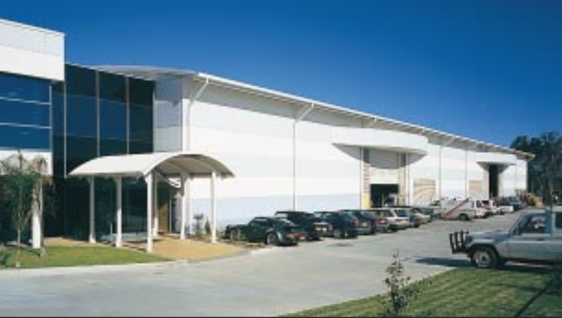
All precast concrete facades can be painted as these hollowcore wall panels have been