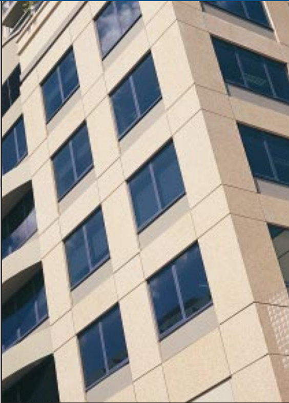
High-rise office building clad with high-quality polished facade panels providing Class 2 finish – the best the precast industry can produce