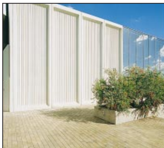
Top quality Class 2 off-form finish in industrial building representative of best industry practice

Hollowcore units are manufactured with slipform or screw feed technology with a standard of finish determined by the characteristics of the machine. Hollowcore units will generally be in the range of Classes 2 and 3 but each manufacturing method will give different results and it is therefore imperative that specifications which are available from the manufacturers be used instead of specifications for conventional concrete.