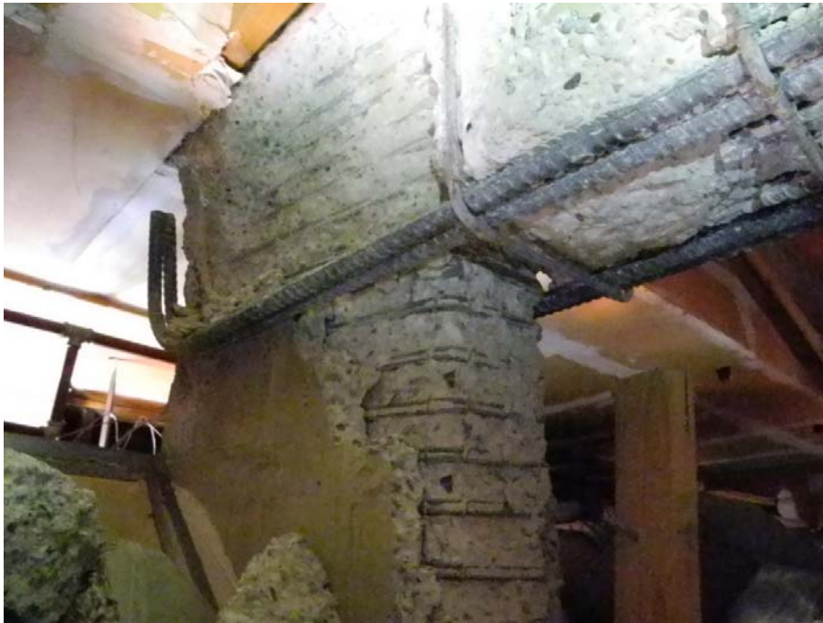
Figure 2 Failure of Transfer Beam, Copthorne Hotel, Christchurch, photograph courtesy Peter McBean

The connections must be capable of transmitting the calculated horizontal earthquake force in order to provide load paths from all parts of the structure, and the earthquake forces carried to the footings and foundation. In turn, the foundations must be robust enough to accommodate the overload due to large events without catastrophic loss of strength.